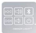
Six Function Button