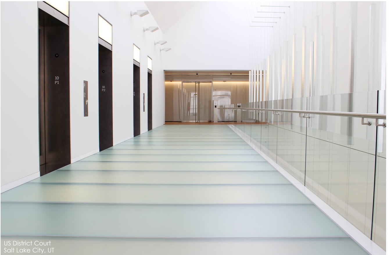
US District Court Salt Lake City, UT