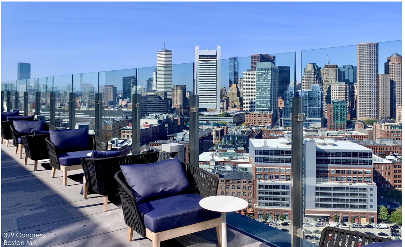
399 Congress Boston MA