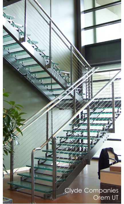
Clyde Companies Orem UT