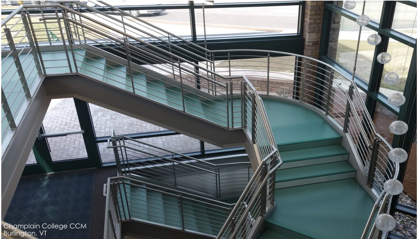
Champlain College CCM Burlington, VT