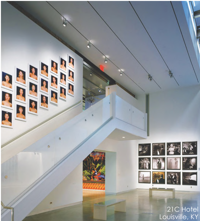
21C Hotel Louisville, KY