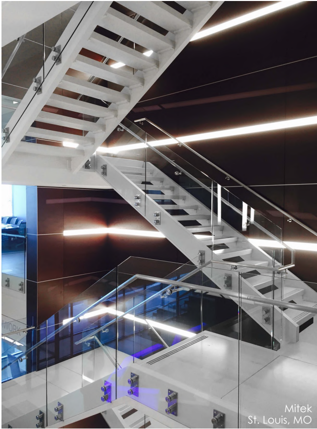
Mitek St. Louis, MO