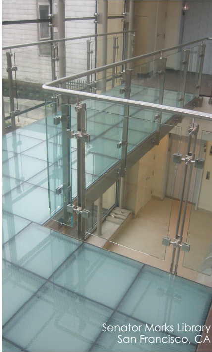
Senator Marks Library San Francisco, CA