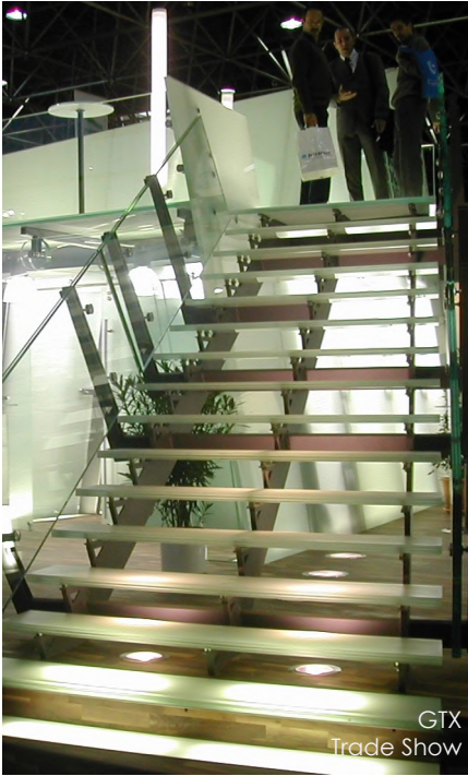
GTX Trade Show