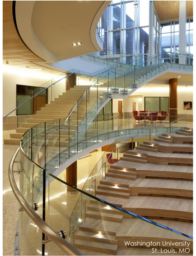
Washington University St. Louis, MO